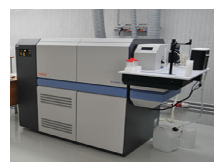
Figure 1: ICP-SFMSEquipment.

It was performed using ICP-SFMS ELEMENT 2/ELEMENT XR (Thermo Fisher Scientific, Bremen, Germany). The system of introducing the sample used is an Apex desolvater nebulizer (CETAC Technologies, Inc., USA) with a microflow nebulizer PFA-100 (Elemental Scientific Inc., USA). The aqueous samples were introduced into the desolvater in continuous flow mode using an autosampler CETAC ASX-520 (CETAC Technologies, Inc., USA), in Figure 1